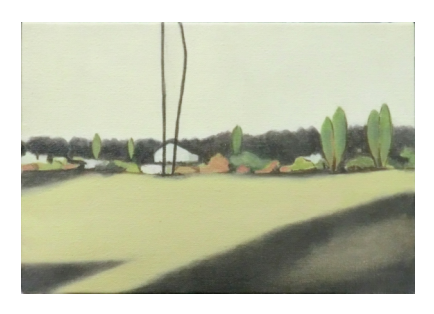
Landscape Oil on canvas/ 15.8x22.7cm/ 2008