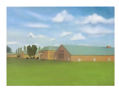
Small Landscape Noienganme Oil on canvas/ 24.2x33.3cm/ 2007

After returning to Japan, she had organized an international art exchange program "Encounters", which meant new development of her artistic career as a curator/organiser.