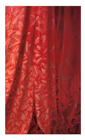
Cloth series, red Oil on wood/ 41.0×24.2cm / 2014